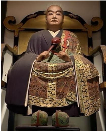
Keizan Zen Master