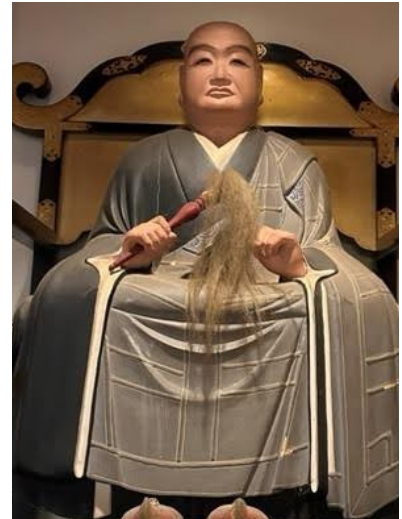
Dogen Zen Master